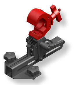
MultiRigg with Clamp Order No. 01223/100kg oder Order No. 01223/250kg for flown systems